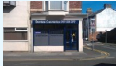
DENTURE COSMETICS LIVERPOOL

Denture cosmetics clinic | 12 Mount Pleasant